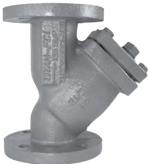
2 1/2" YS 58-CI